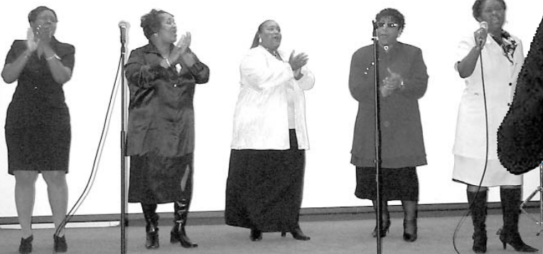
Pleasant Grove Baptist Church Ensemble.