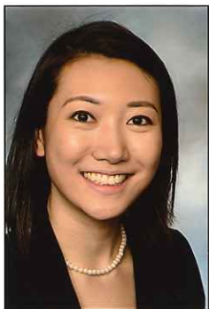
Yun Song General Surgery