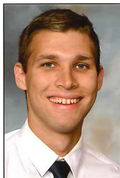
Alexei Adan Orthopedics