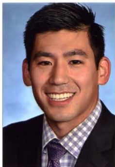
Chad Sudoko Otorhinolaryngology