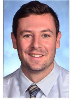
Gino Inverso Oral Surgery