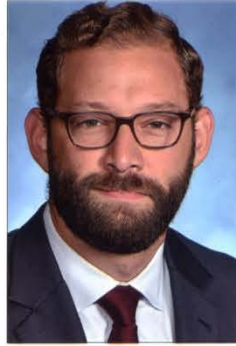
Ari Wes Plastic Surgery