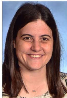
Lauren Boden Orthopedics